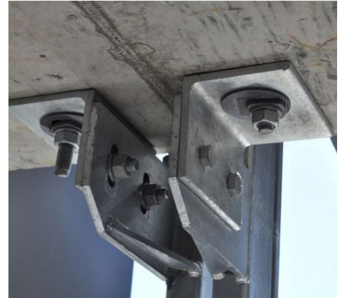
Upper connection: Reid OrbiPlate and Ramset TruBolts

Paul Grech agrees, stating that “the OrbiPlate would be considered in other projects and applications. On this occasion, The patented OrbiPlate™ system delivers connection tolerances of 20mm in any direction. It is comprised of an 80mm main circular washer with an elongated slot surrounded by serrated teeth that provide the effective mechanical lock with a secondary, smaller washer used to position the main structural M20 bolt as required main access to a busy shopping centre. With post installed anchors to be used on this project, the concern was the potentially significant idle crane time whilst the holes are drilled and the anchors set for each of the architectural screens.