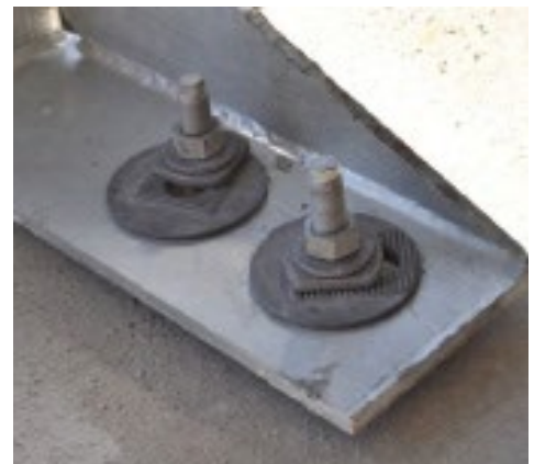
Lower Connection: Reid OrbiPlate and Ramset ChemSet 502